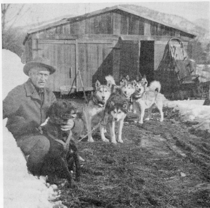
CHAPMAN'S DUKE (left swing)

Disko & Baldy won Best Brace in Show at Raceland (Northshore) MA. 1944.